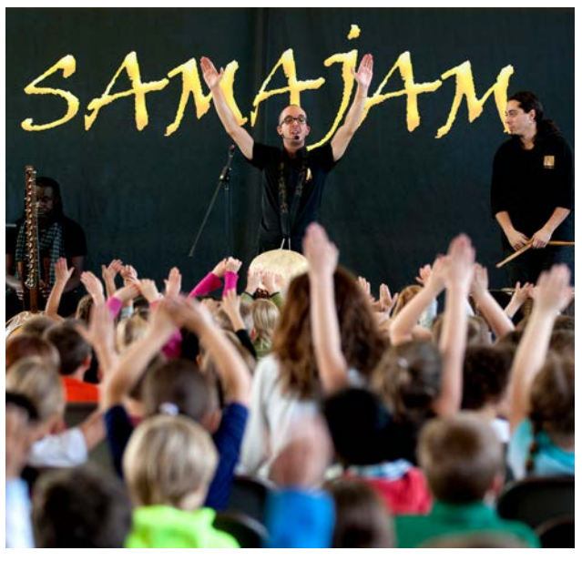
SAMAJAM: 14,000 CHILDREN IN 7 YEARS!

Considered the biggest musical project aimed at keeping kids in school, Samajam helps children from poor neighbourhoods and those coping with special challenges take part in a stimulating musical experience, as part of a weekly program of instrumental music, percussion, singing, dance and stage production.